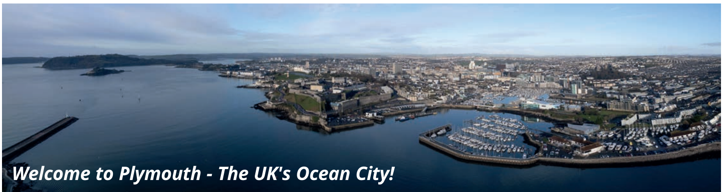
Welcome to Plymouth - The UK's Ocean City!