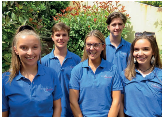
British Student Hosts