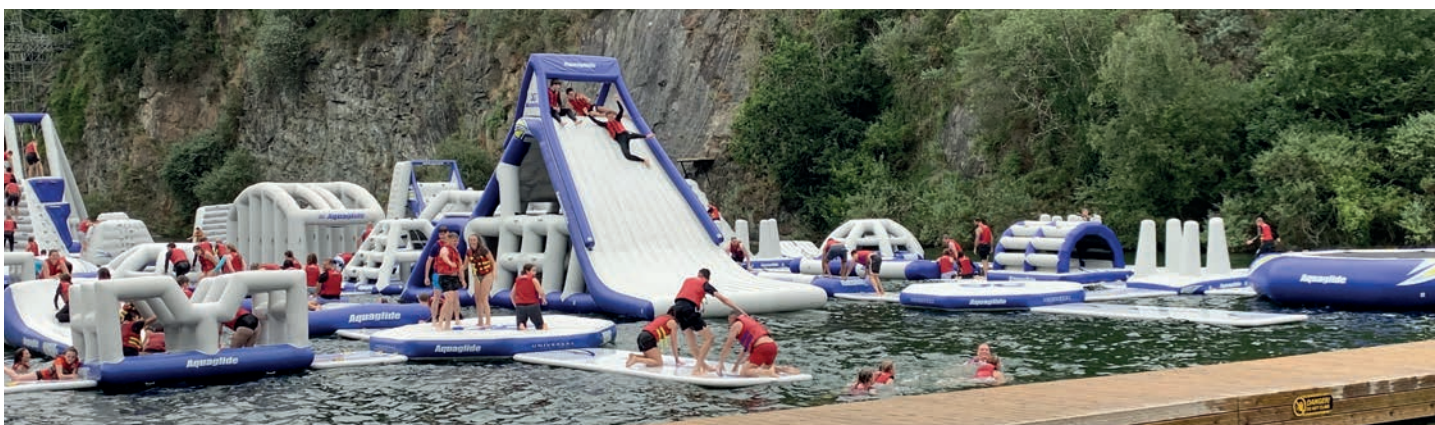
Adrenaline Water Park