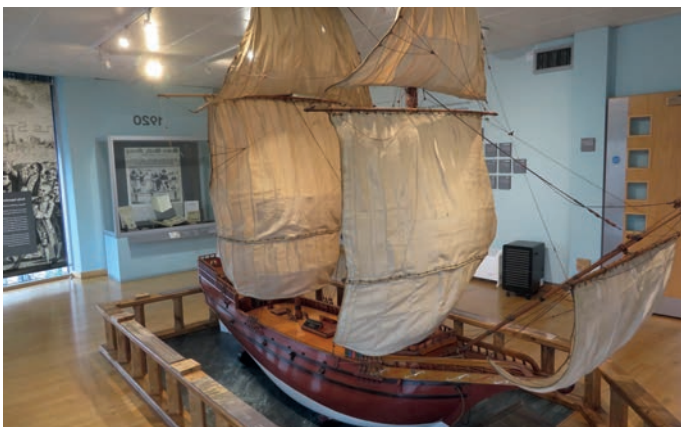
A model of the Mayflower