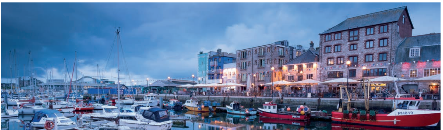
The Barbican at Plymouth