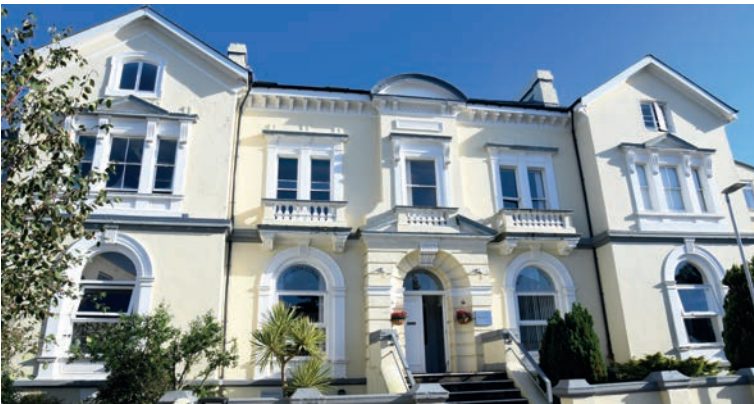
A Boarding House at Plymouth College

Students will live in the boarding houses of Plymouth College. The houses are large Victorian buildings, with comfortable modern facilities. Students will use the facilities of Plymouth College and will have three meals a day in the dining room.