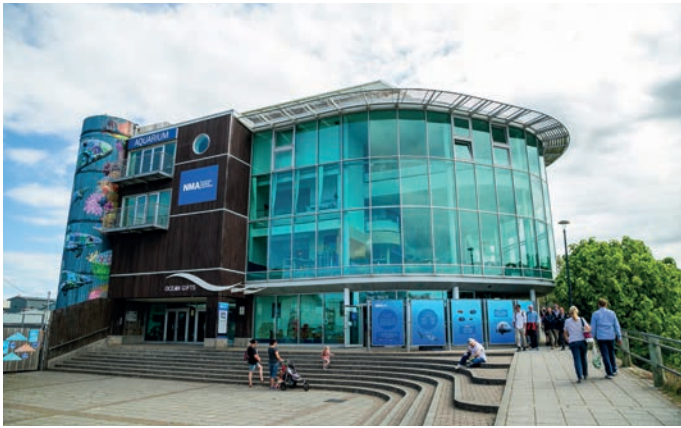
The National Marine Aquarium