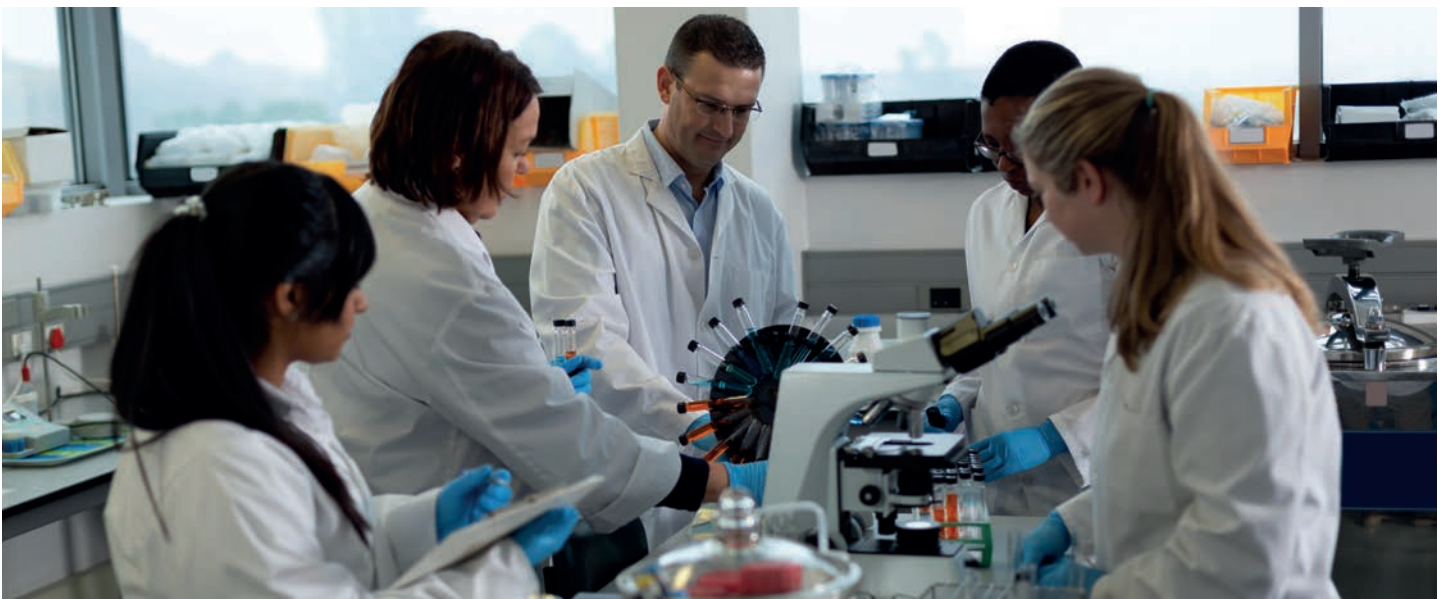
Scientists at work