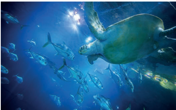
Inside the Aquarium