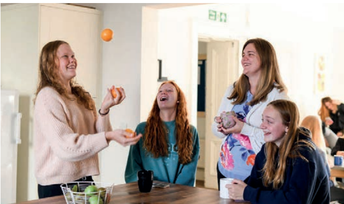
In the Boarding House

Most students will live in double rooms, but there are also some singles and some rooms with three beds. There are kitchens and lounges for students to relax. House staff live in the Boarding Houses to look after you.