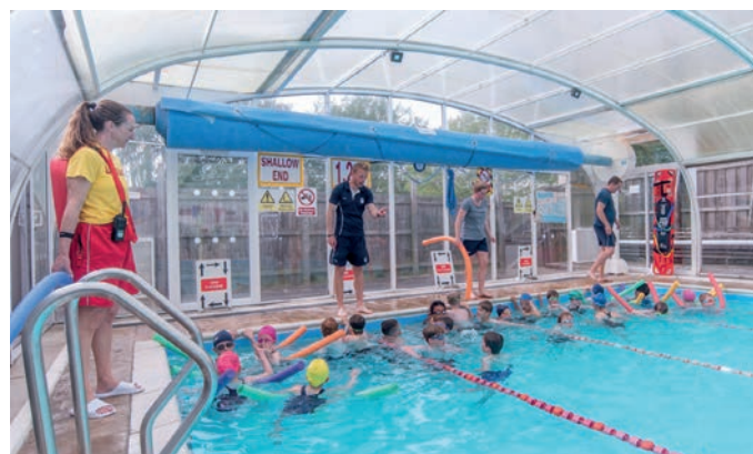
The Swimming Pool