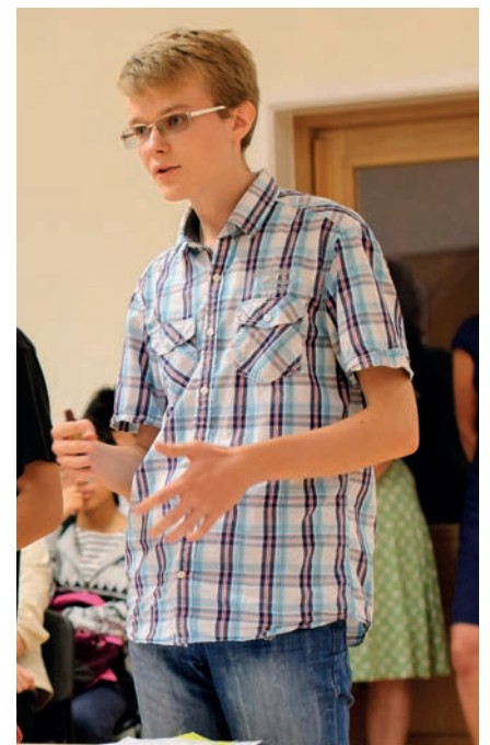
Giving a presentation