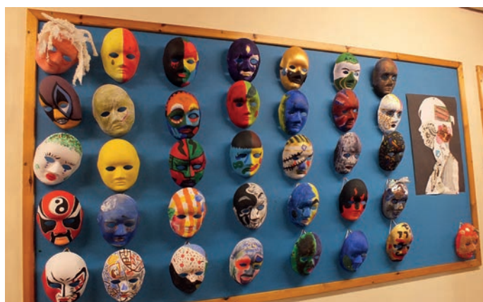
Masks made in Art lessons