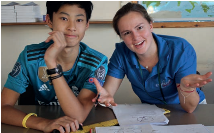
Do come and join us