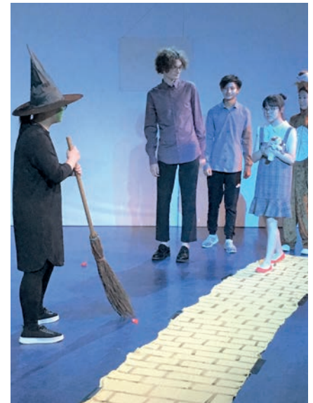
The Drama Show