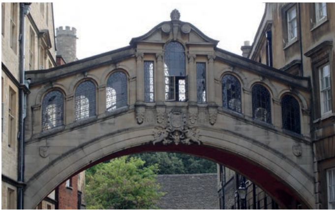
Hertford Bridge, Oxford