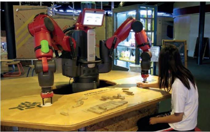
Meeting a robot at the Science Museum