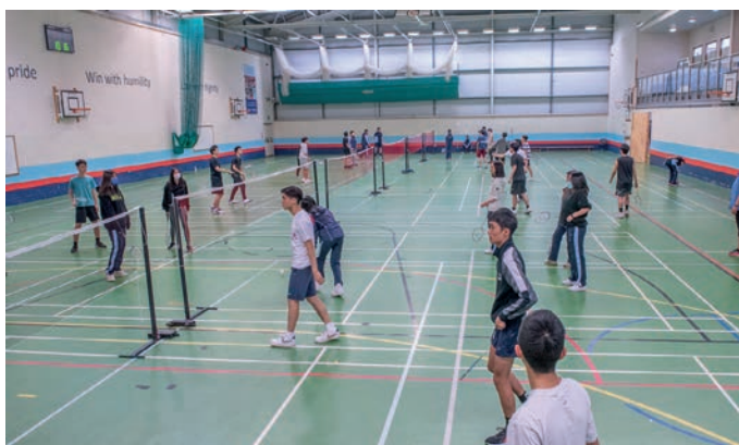
The Sports Halls

Wellington School has wonderful facilities for sport, including a Sports Centre, a heated swimming pool, eight tennis courts, an Astro pitch and lots of grass playing fields. We will introduce students to many traditional British sports.