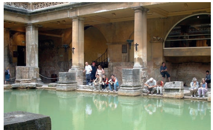
The Roman Baths

A beautiful stately home, where kings and queens have stayed. Students will drive through lions and tigers in the Safari Park, and then visit the 400-year-old house, have fun in the world's biggest maze, and feed the sea-lions from the boat on the lake