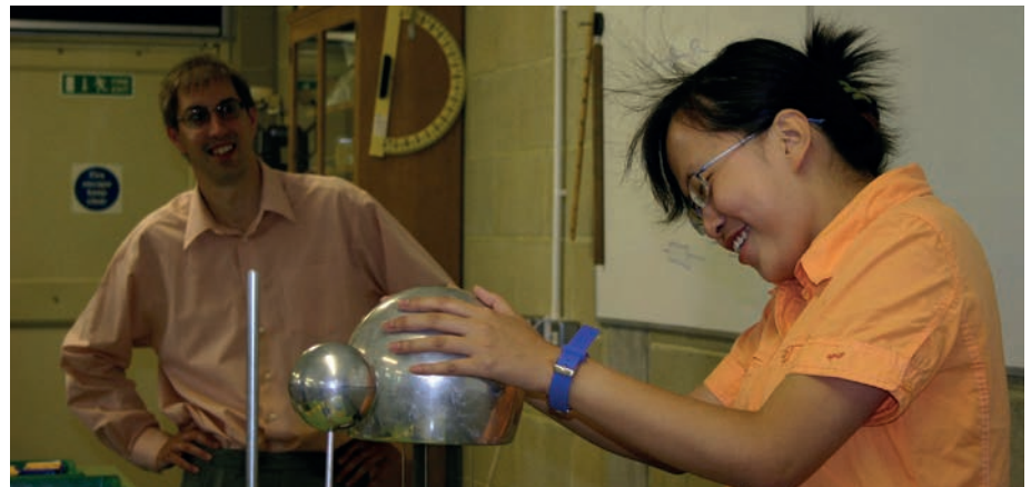
Fun with Physics