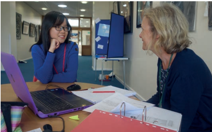
A one-to-one tutorial