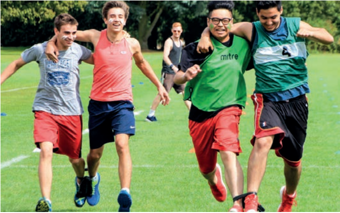
Enjoying a three-legged race