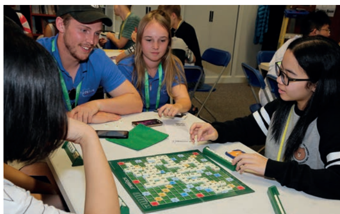
Learning English through games