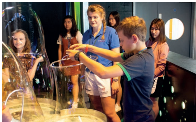
At The Bristol Science Museum

We will visit the world's top university, set in a beautiful city. We will look at the famous colleges and have time to stroll around the city.