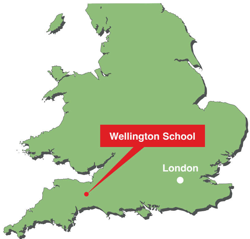
You can travel from London to Wellington School in about two hours by train.

Note: There are at least three other towns in the UK called Wellington. Make sure you come to the right one!