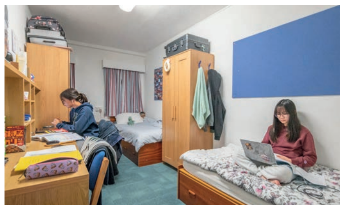
A Bedroom in a Girls' House