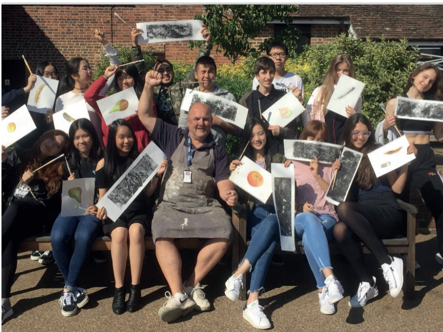
Art teacher with his students