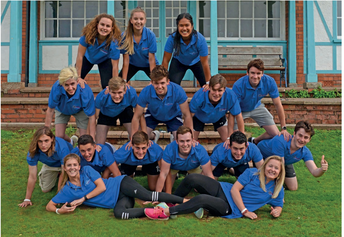
Some of our British Student Hosts