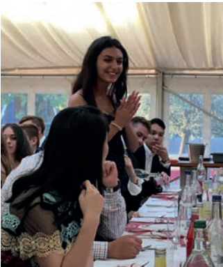
Formal Dinner speech