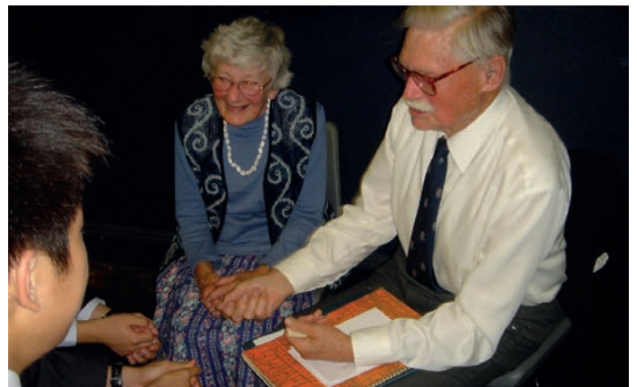
The Speed-Chatting evening

Every teaching day we have one lesson of sport. We introduce students to British sports such as netball, hockey, rugby, cricket and tennis so that students will be able to take part at their new schools. There are many opportunities for students to play familiar sports such as football, basketball and badminton in the evenings and on Sundays.