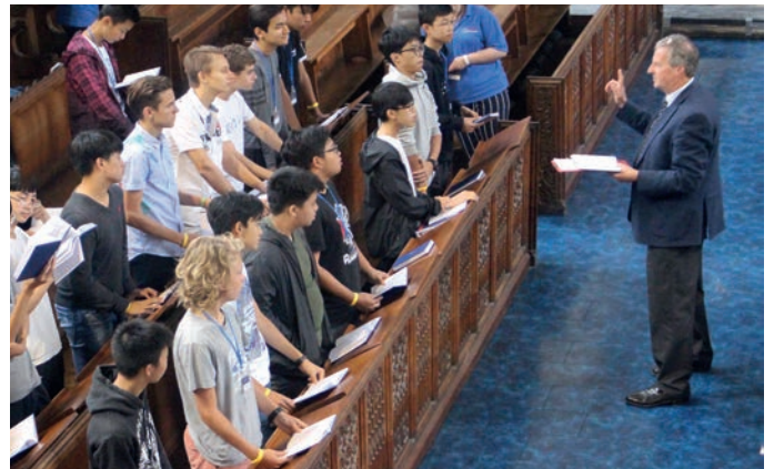
A Boarding Preparation class