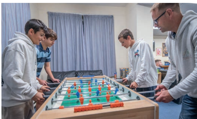
Table Football in a Boys' House