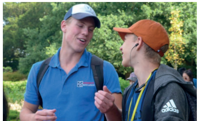
Student Hosts are funny and friendly!