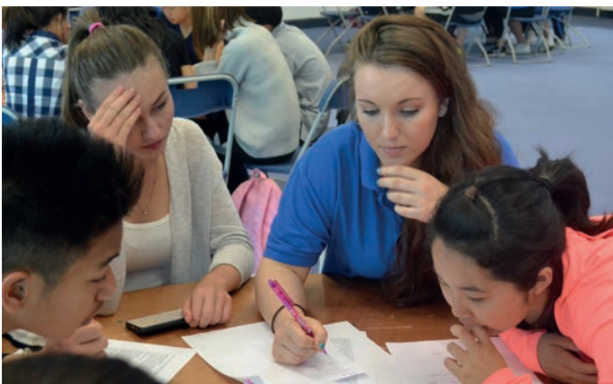
Student Hosts help you work and play

They are with you after classes and all day when there are no lessons, so you can spend 50 hours a week chatting in English with native speakers if you want to do so!