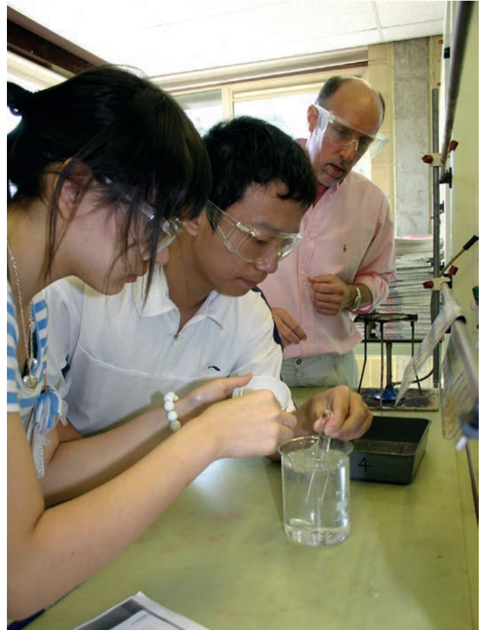
A Chemistry lesson

All subjects are taught by qualified subject specialists. In all subjects, the teachers will focus on the English language which students will need for studying that subject.