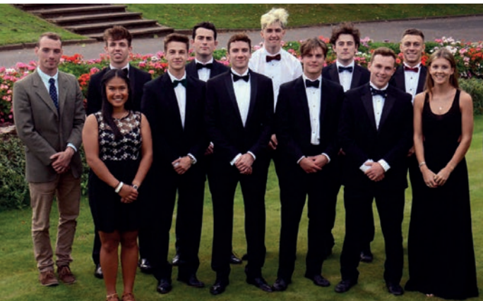
Student Hosts preparing for the Formal Dinner