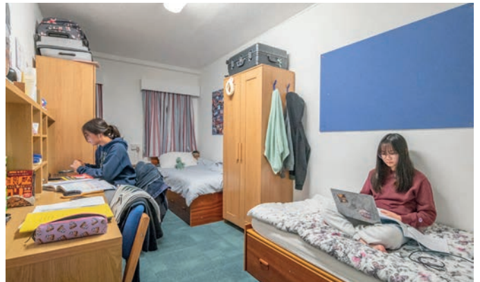
A Bedroom in a Girls' House