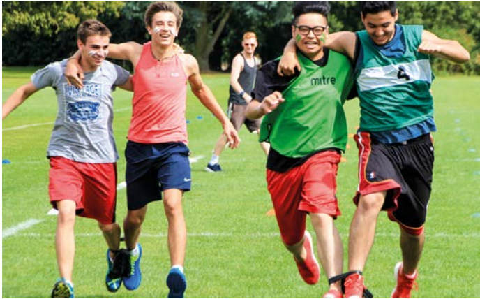
Enjoying a three-legged race