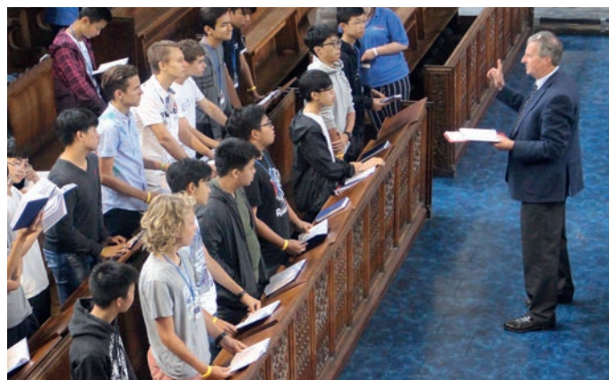
A Boarding Preparation class