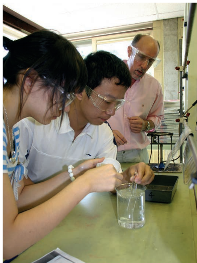
A Chemistry lesson

All subjects are taught by qualified subject specialists. In all subjects, the teachers will focus on the English language which students will need for studying that subject.