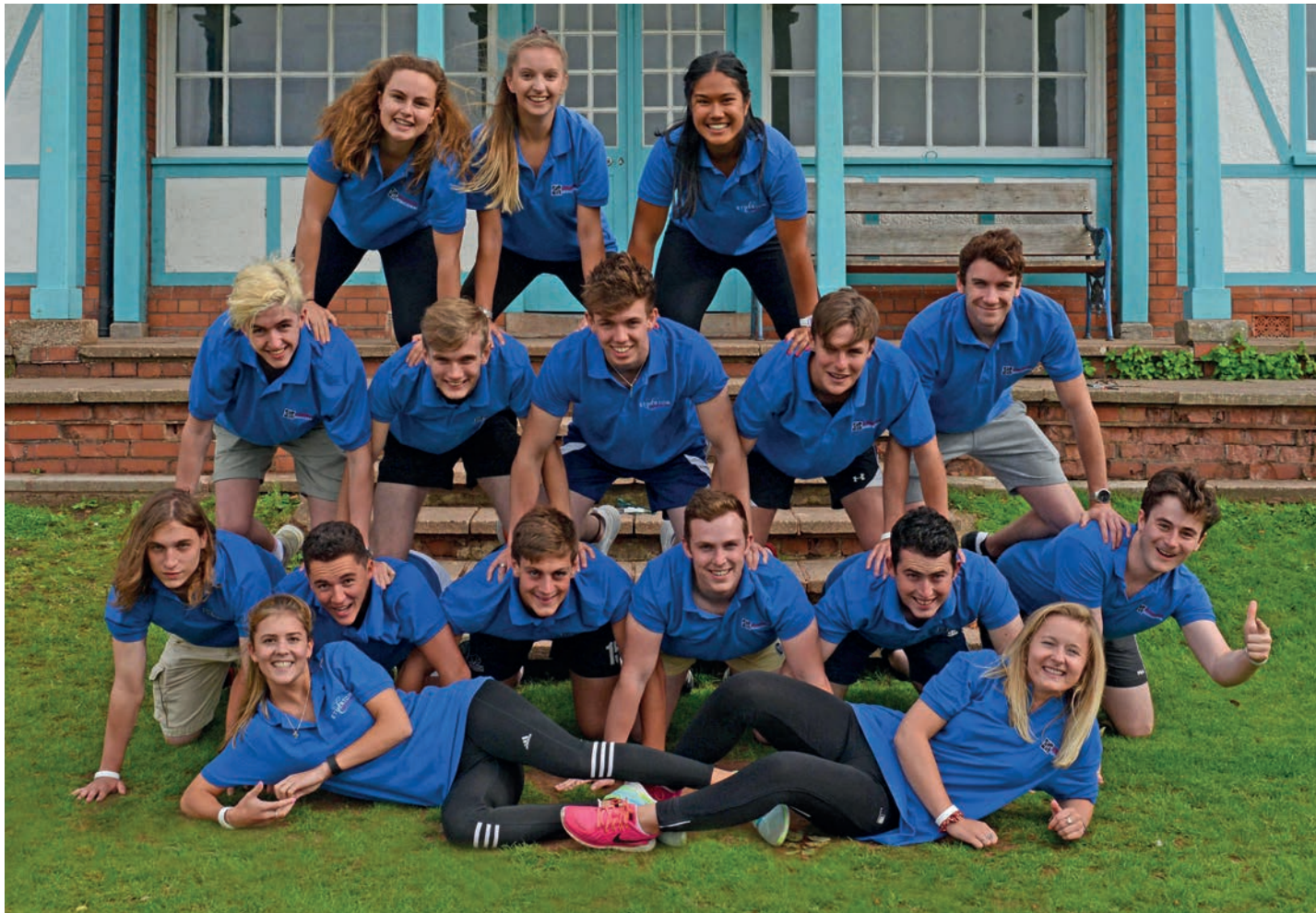
Some of our British Student Hosts