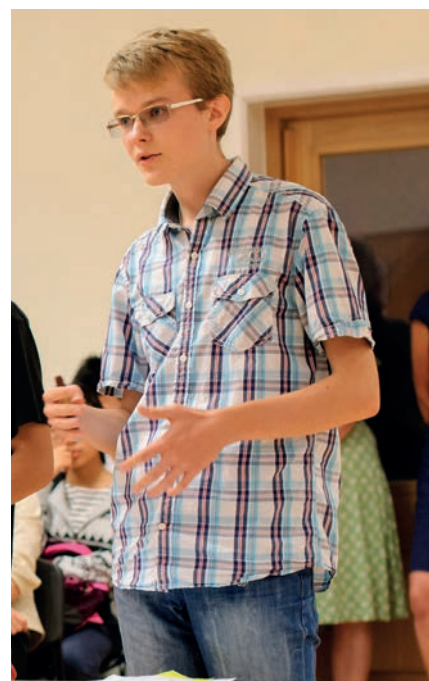
Giving a presentation