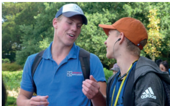
Student Hosts are funny and friendly!