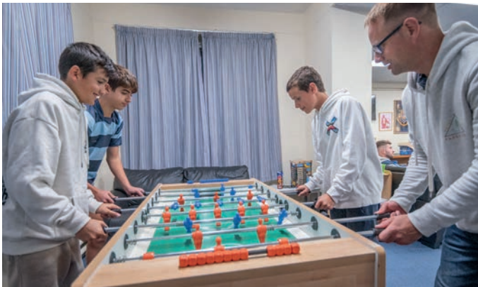
Table Football in a Boys' House