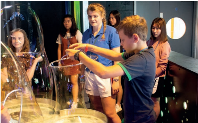
At The Bristol Science Museum

A beautiful stately home, where kings and queens have stayed. Students will drive through lions and tigers in the Safari Park, and then visit the 400-year-old house, have fun in the world's biggest maze, and feed the sea-lions from the boat on the lake