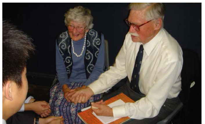
The Speed-Chatting evening

Every teaching day we have one lesson of sport. We introduce students to British sports such as netball, hockey, rugby, cricket and tennis so that students will be able to take part at their new schools. There are many opportunities for students to play familiar sports such as football, basketball and badminton in the evenings and on Sundays.