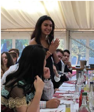
Formal Dinner speech