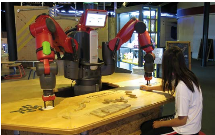
Meeting a robot at the Science Museum