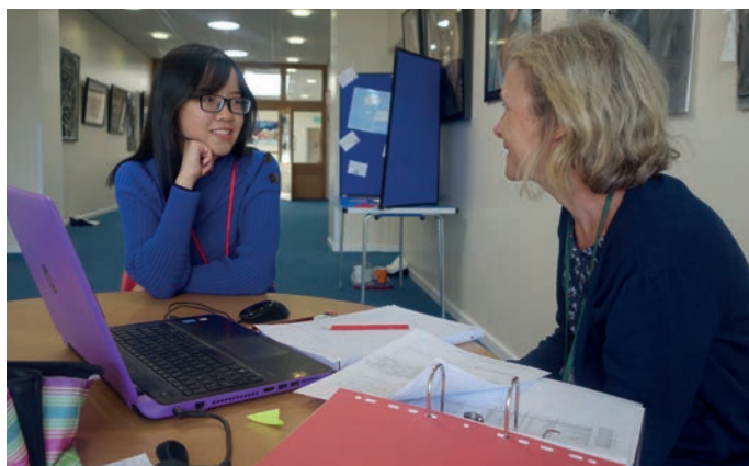
A one-to-one tutorial