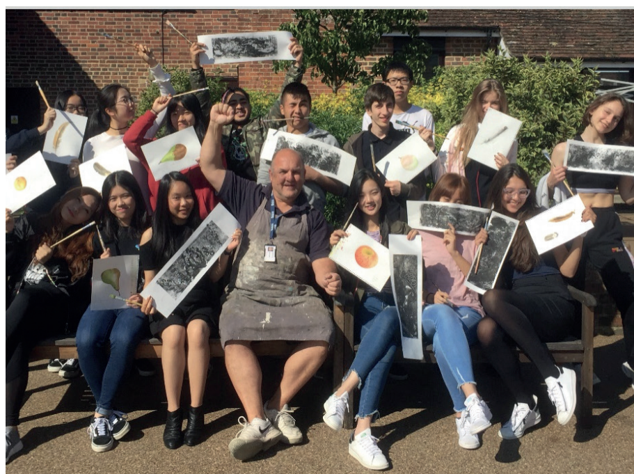
Art teacher with his students