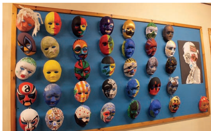
Masks made in Art lessons