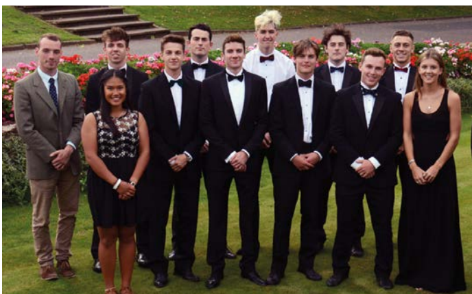
Student Hosts preparing for the Formal Dinner