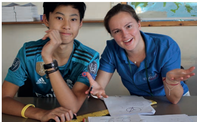
Do come and join us