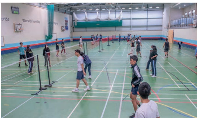
The Sports Halls

Wellington School has wonderful facilities for sport, including a Sports Centre, a heated swimming pool, eight tennis courts, an Astro pitch and lots of grass playing fields. We will introduce students to many traditional British sports.