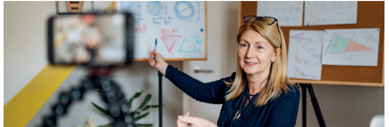
Live Online Teaching

This summer we will be running Pre-GCSE and Pre-A-Level Online Courses for international students aged 13 – 17. Our courses are perfect as an introduction to British Boarding School life. All from the comfort of your own home.